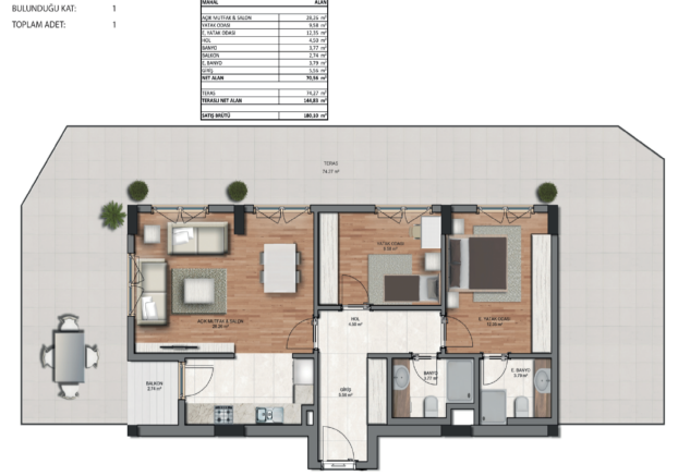
SD 2.2.1 TERASLI