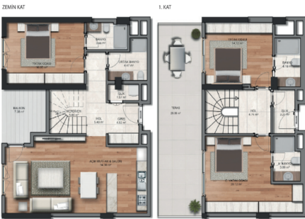
ÇD 3.2.1 TERASLI