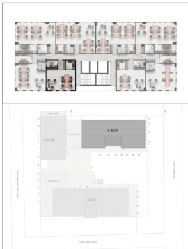
A BLOK OFİS ZEMİN KAT TİP PLANI

B BLOK 3+1 DAİRE (3,9,15,21,27,33,39,45,51,57) NET: 111,70 M 2 BRÜT: 161,97 M 2 1 HOL: 14,15 M 2 2 SALON: 30,85 M 2 3 MÜTFAK: 12,50 M 2 4 YATAK ODASI: 10,20 M 2 5 YATAK ODASI: 9,90 M 2 6 BANYO: 4,45 M 2 7 E. YATAK O.: 16,95 M 2 8 GYMNASE O.: 4,55 M 2 9 E. BANYO: 3,70 M 2 10 BALKON: 4,50 M 2 11 ÇAMAŞIR O.: 0,65 M 2