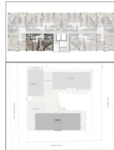
B BLOK NORMAL KAT TİP PLANI

A BLOK OFİS (1,9,17,25,33,41,49,57,65,73) NET: 50,60 M 2 BRÜT: 73,37 M 2 1 HOL+ANTRE: 4,70 M 2 2 AÇIK OFİS: 34,56 M 2 3 MÜTFAK: 5,06 M 2 4 BANYO: 6,28 M 2